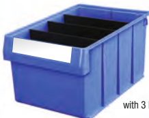
AK-422 with 3 Nos of AK-422/HP

Tote Bins fitted with Vertical & Horizontal partitions.