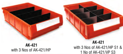
AK-421 with 3 Nos of AK-421/HP